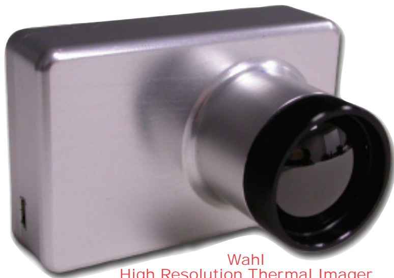
Wahl High Resolution Thermal Imager HSI2500S