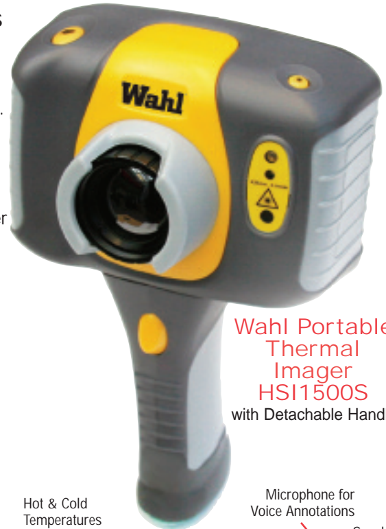
Wahl Portable Thermal Imager HSI1500S with Detachable Handle

Always verify human temperature with a medical thermometer.